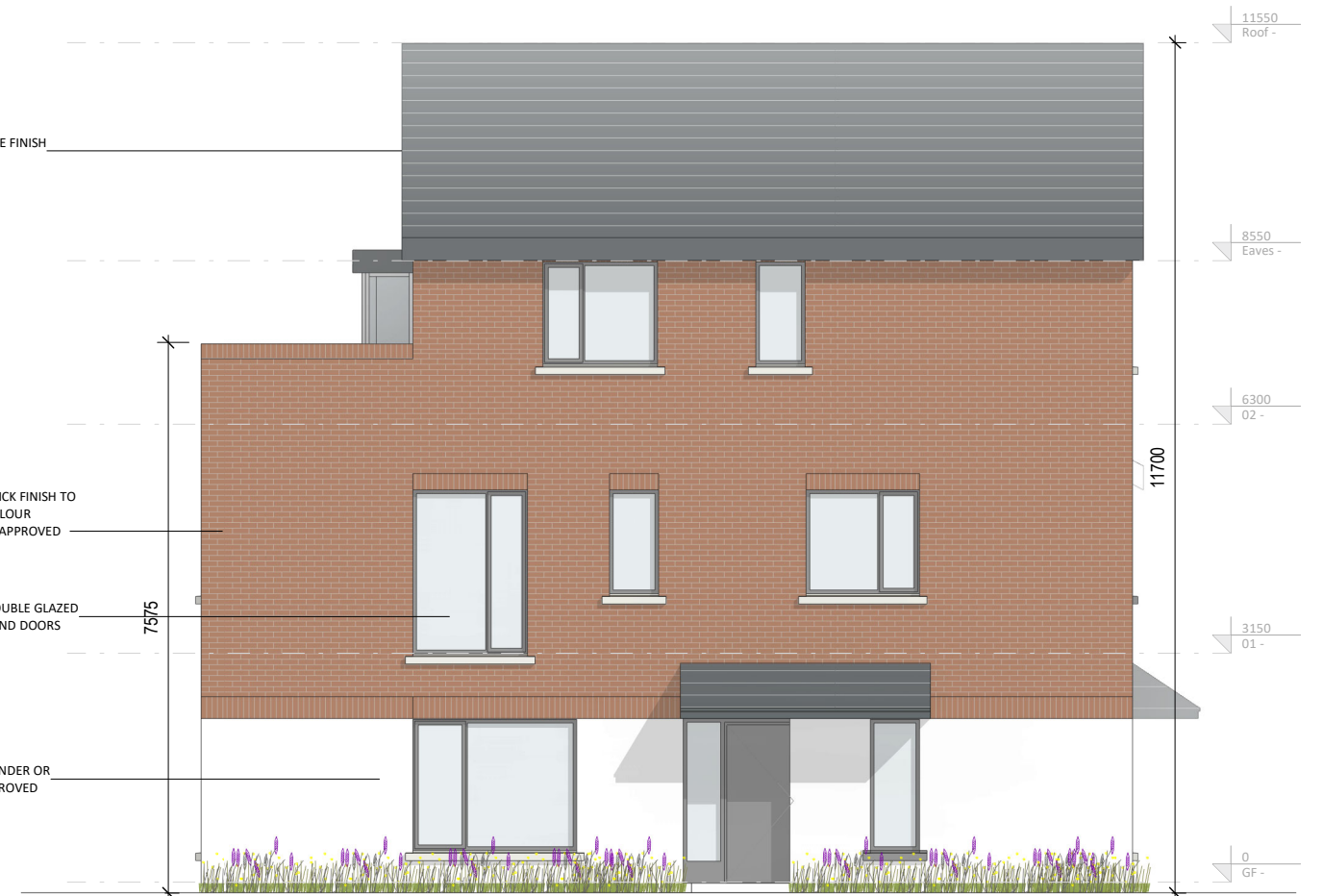
2 Side Elevation 01 1 : 100