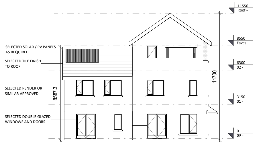
3 Rear Elevation 1 : 200